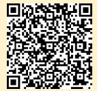
「Lear-cation Day」 Aichi Prefecture